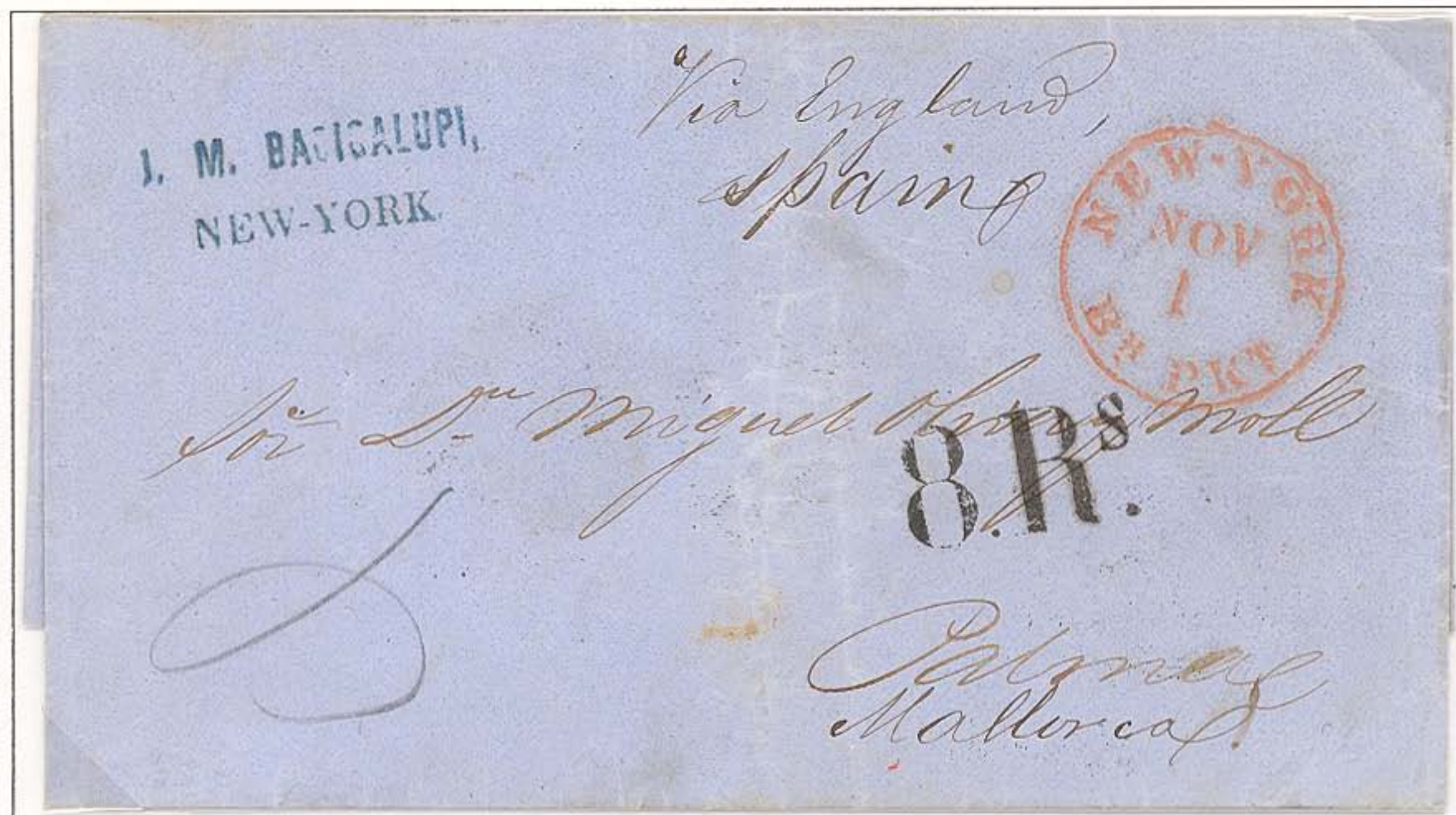
Folded Letter: Albany, New York to Palma, Mallorca, 25 October 1859