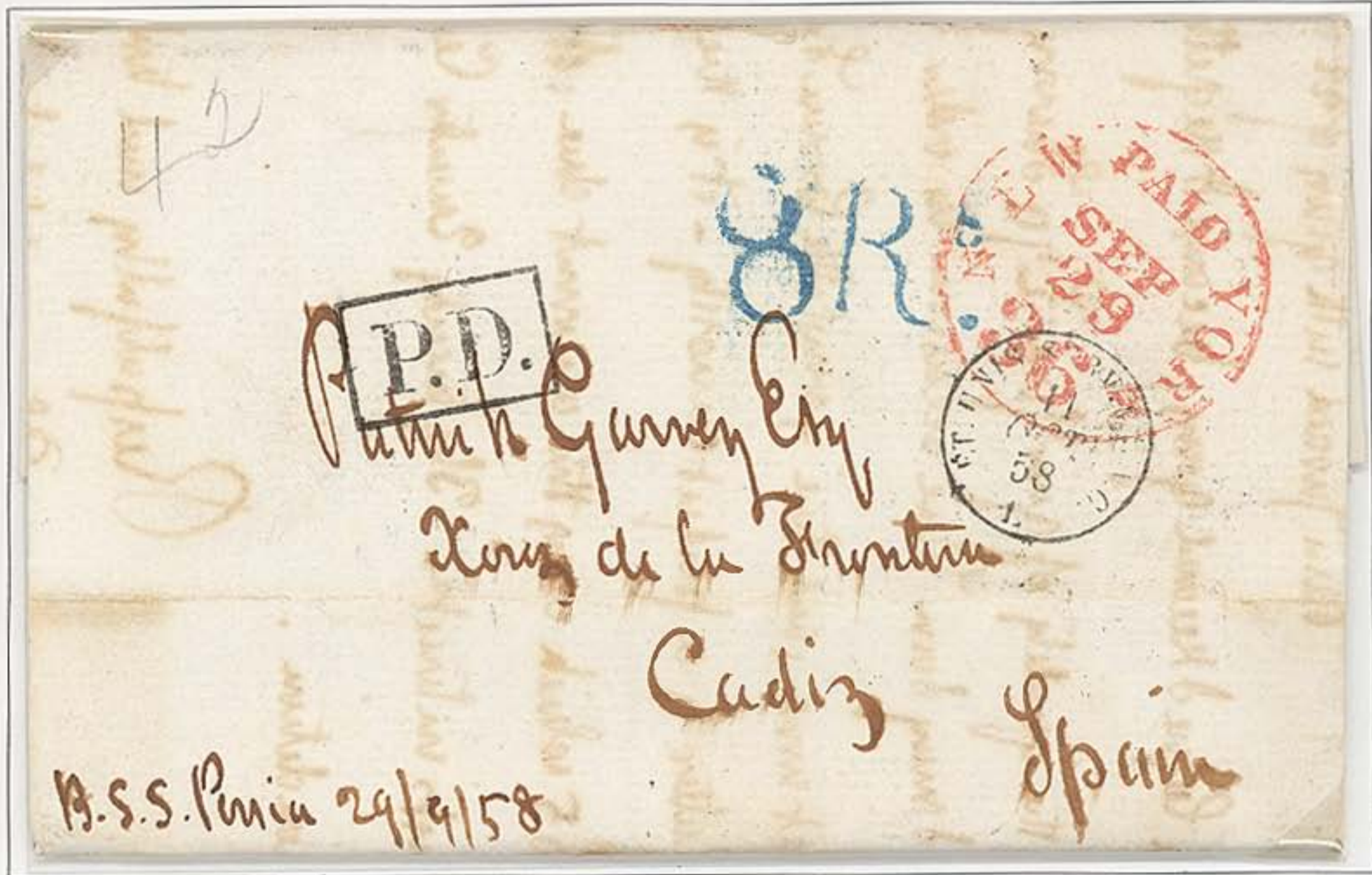
Folded Letter: New York to Jerez de la Frontera, Spain, 28 September 1858

Ship: Persia Company: British & North American Royal Mail Steam Packet Company (Cunard Line) Depart: New York, 29 September 1858 Arrive: Liverpool, 10 October 1858 Rate: 42¢ prepaid for double French Mail rate 36¢ U.S. credit to France 8 reales postage due in Jerez de la Frontera