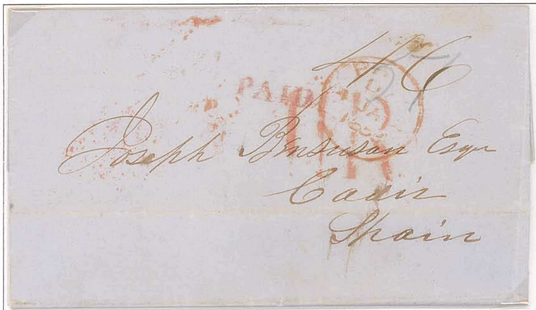
Folded Letter: Boston to Cadiz, Spain, 14 December 1852