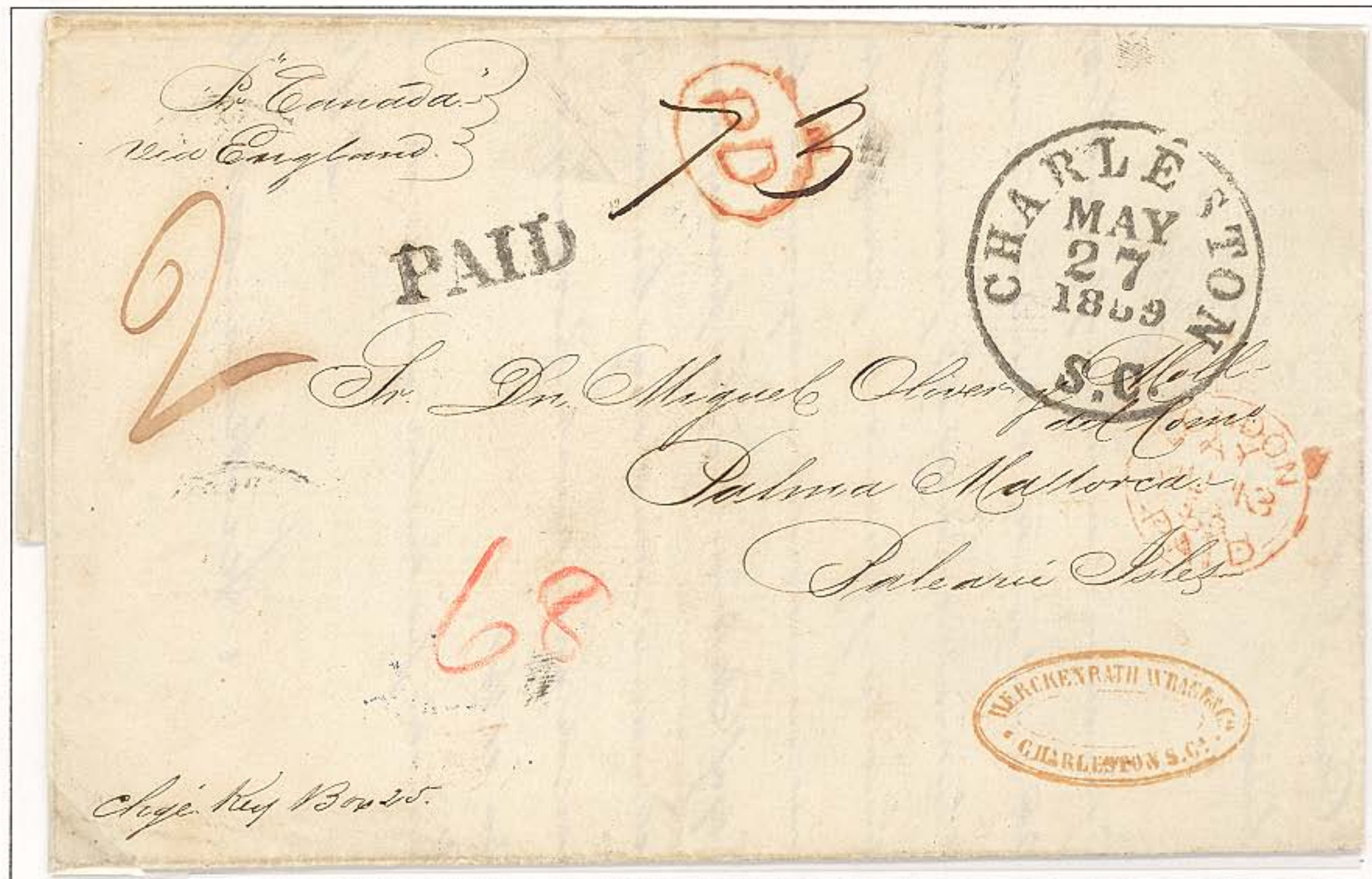
Folded Letter: Charleston, South Carolina to Palma, Mallorca, 27 May 1859