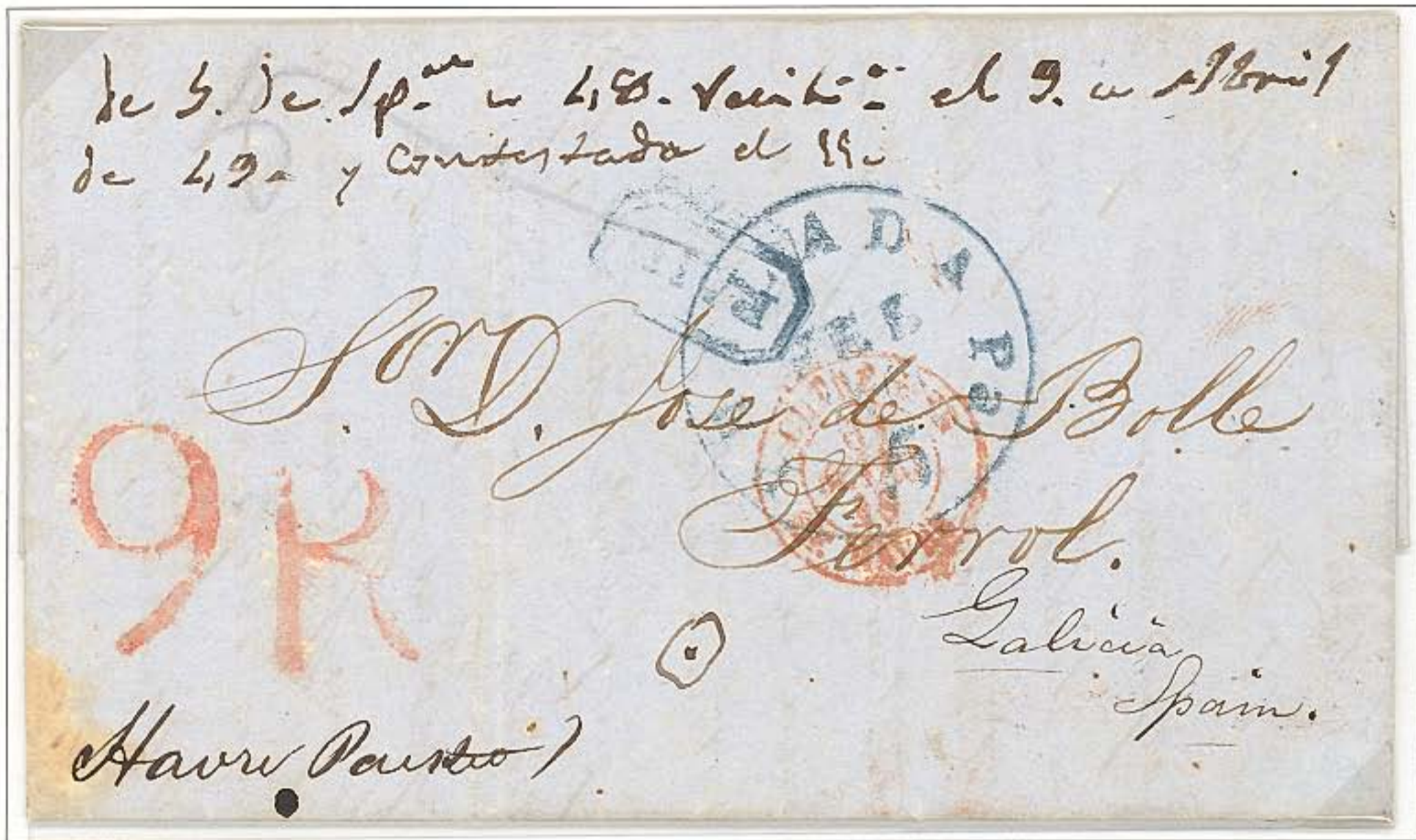
Folded Letter: Philadelphia to Ferrol, Spain, 5 September 1848