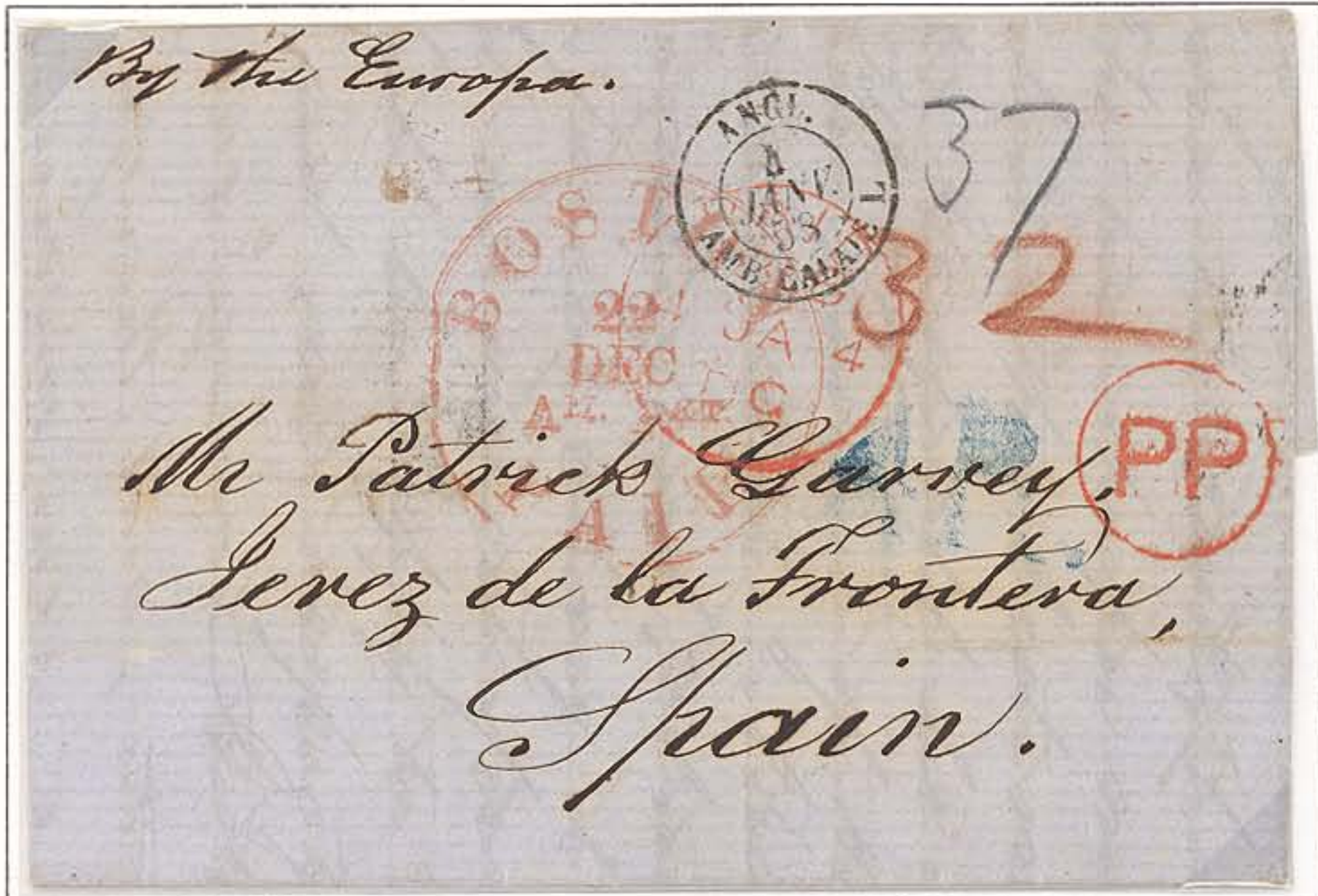
Folded Letter: Boston to Jerez de la Frontera, Spain, 22 December 1857