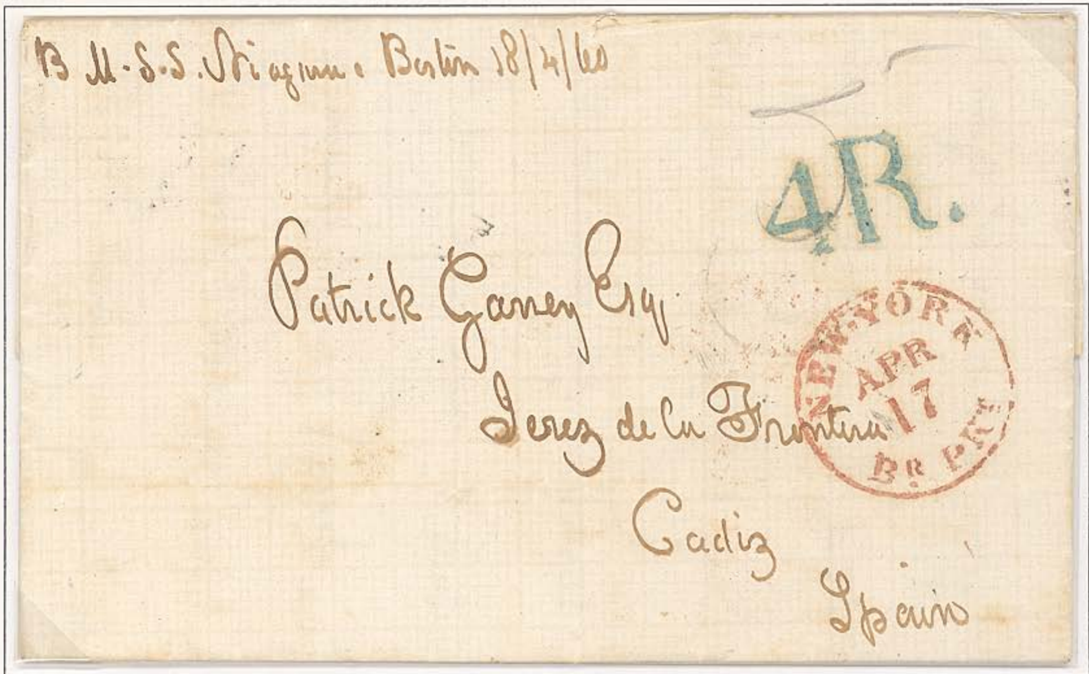
Folded Letter: New York to Jerez de la Frontera, Spain, 17 April 1860