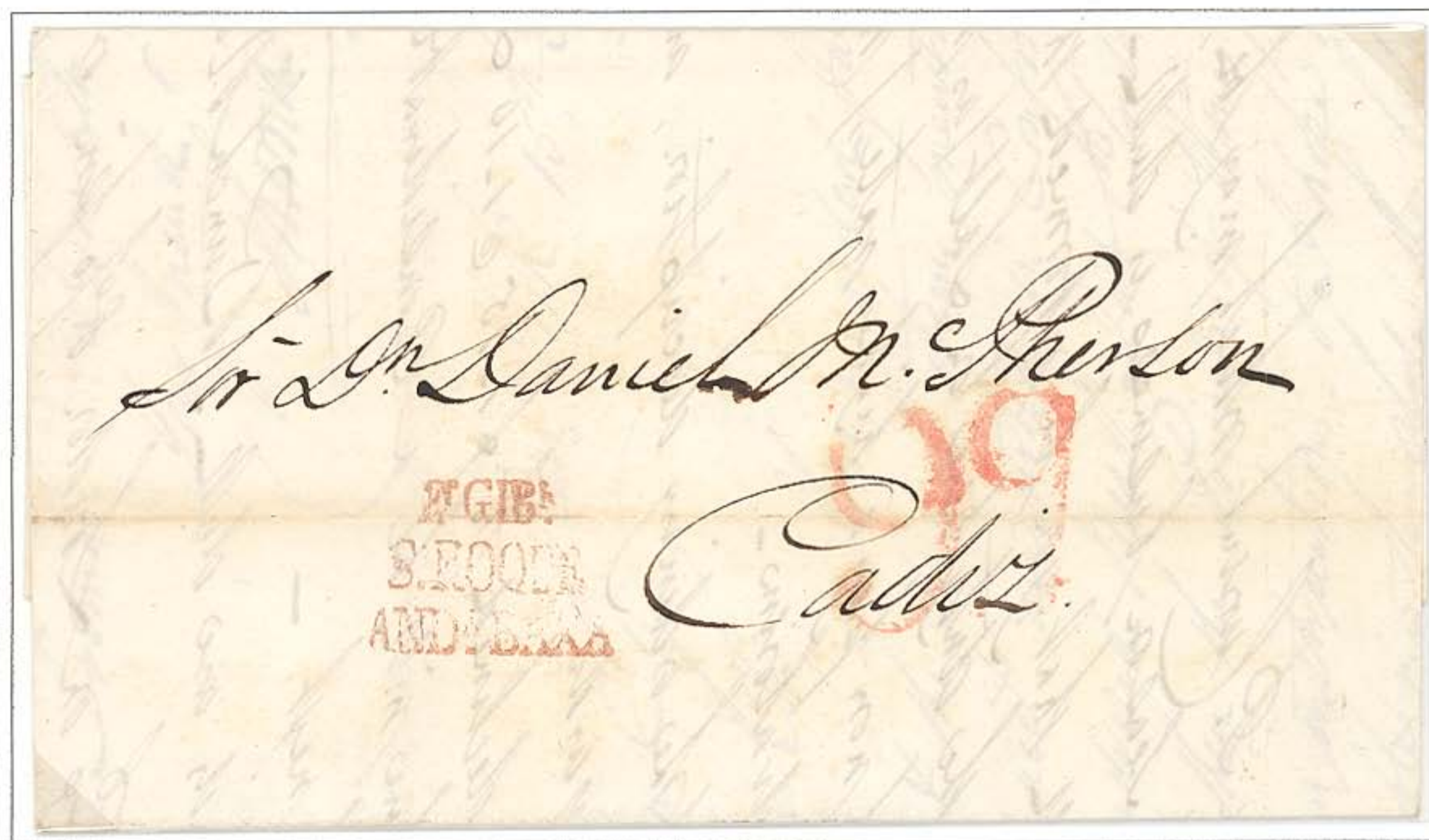
Folded Letter: New York to Cadiz, Spain, 15 February 1842