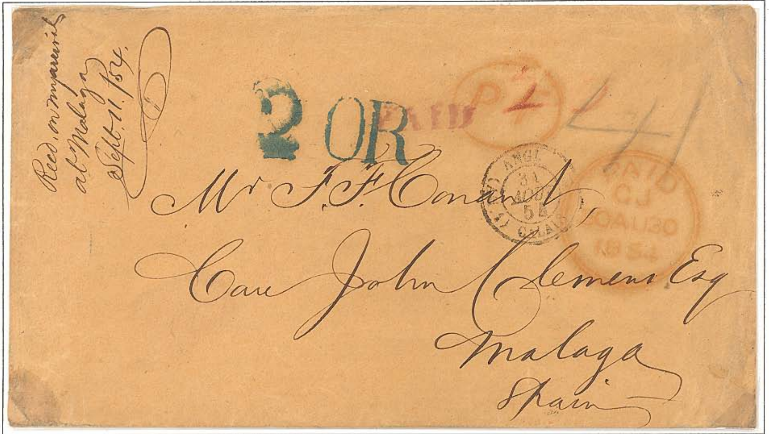
Envelope: Boston to Malaga, Spain, 18 August 1854