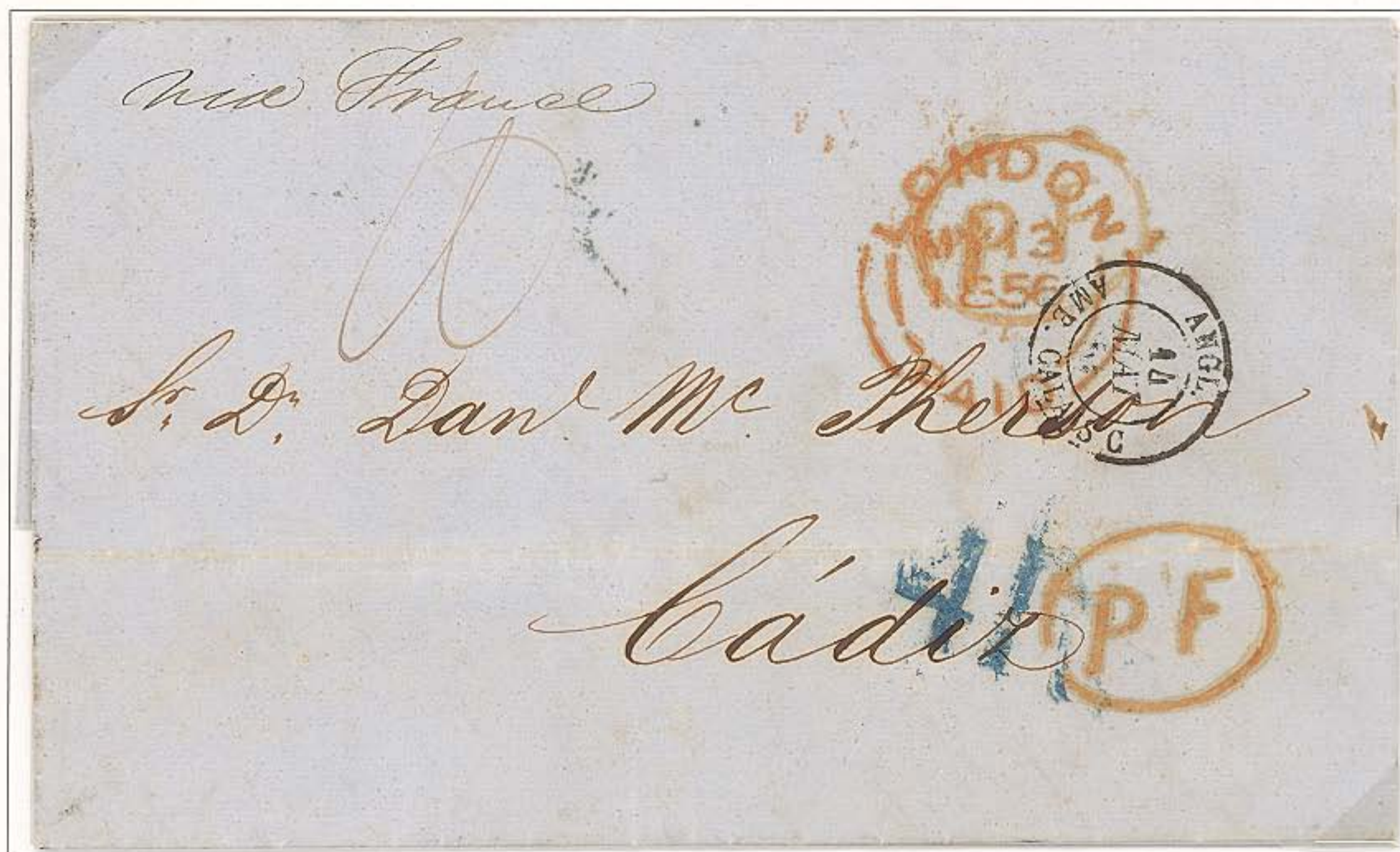
Folded Letter: New York to Cadiz, Spain, 30 April 1856

1849-1867 15 February 1849-31 December 1867