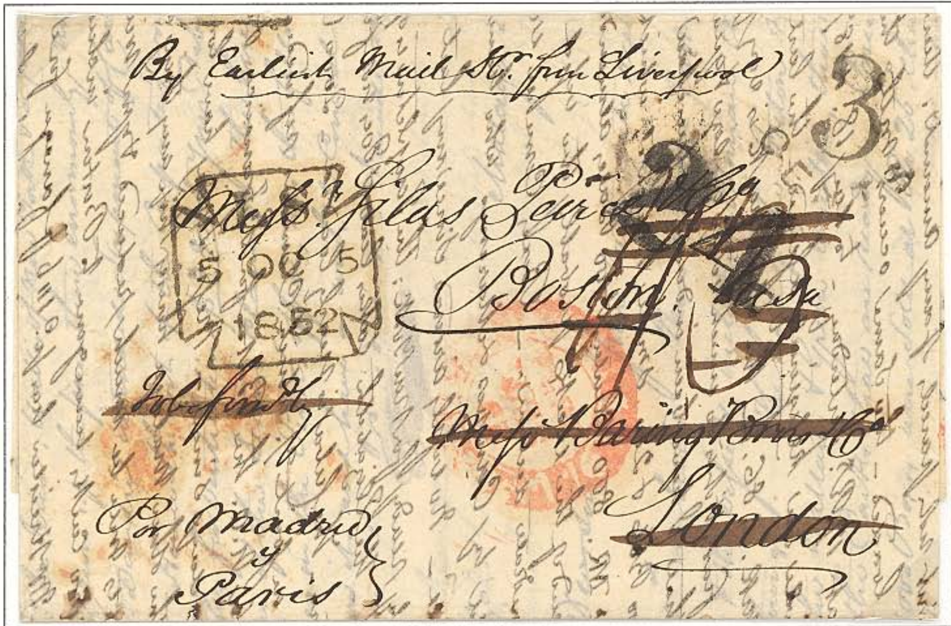
Folded Letter: Malaga, Spain to Boston, 26 September 1852