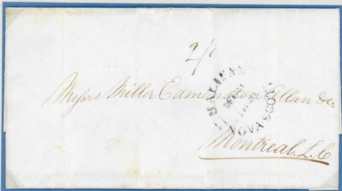
16th December 1840, Halifax, entire with letter two-part circle cancel (used 12/9/1839 to 5/7/1843) to Montreal rated 2/1s.cy.