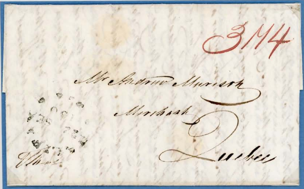
22nd September 1830, Halifax, entire letter with Fleuron type to Quebec. A double letter rated 3/4s.cy.