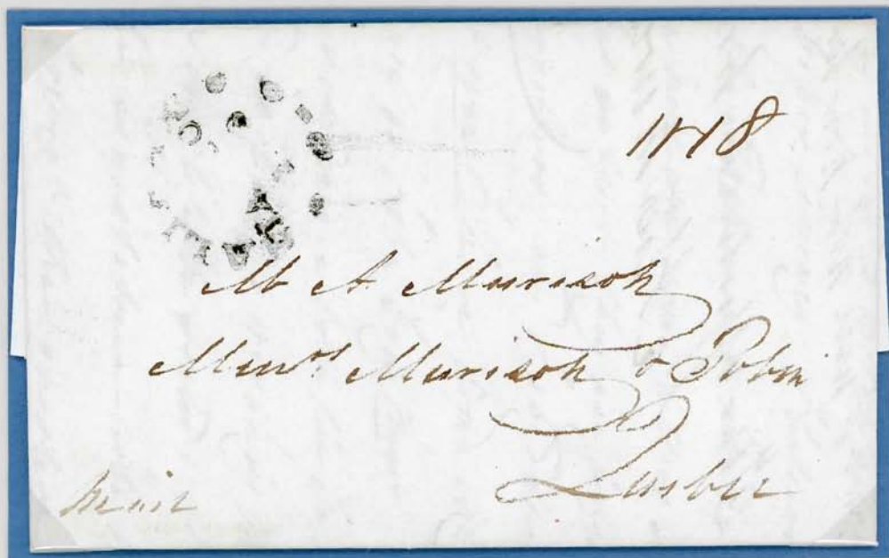
30th January 1833, Halifax, entire letter with Fleuron type to Quebec. Single letter rate 1/8s.cy.